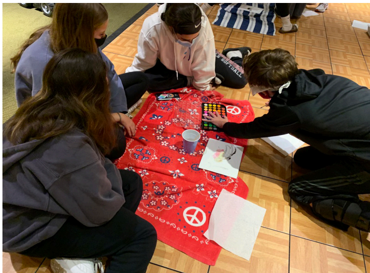
BIFTY had fun painting while blindfolded!

*On January 20, we will be going ice skating at The Rink at Longshore in Westport, CT, from 7:15-8:45 p.m. (regular BIFTY time). It costs $14 to skate and $5 to rent skates. Teens are responsible for all costs and transportation to and from ice skating.