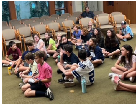
Vav (6th grade) students listen intently as they learn some new Rosh Hashanah songs.