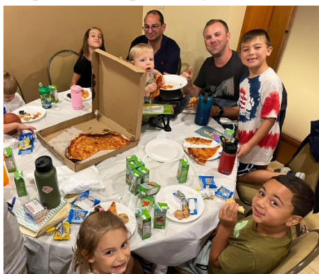
New Gan (Kindergarten) families enjoy the pizza lunch picnic together.