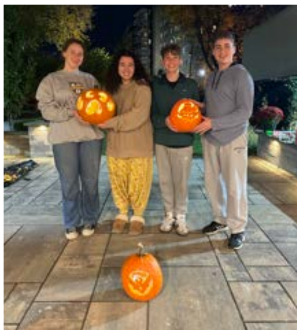
BIFTY had fun carving pumpkins!